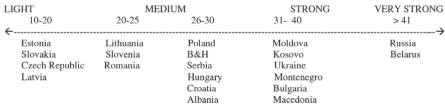
Figure 2. Politicisation of media systems in CEE countries.

The politicisation of the media is one of the most visible and painful problems in the CEE countries, specifically in the Balkans. The process of media change in this region is more dynamic than in Western Europe, as emerges from quantitative and qualitative academic research and indices. (Bajomi-Lázár, 2014; 2017; Dobek-Ostrowska, 2015a; 2015c; 2015b; Zielonka, 2015; Castro Herrero et al. , 2017) As can be seen in Figure 2 , in terms of politicisation, we can highlight good amount of variety in this part of Europe. The four countries included in this analysis also show different levels of politicisation. In the cases of Albania and Serbia, the politicisation of the media has an average level, with scores between 26 and 30. On the other hand, in the case of the other two countries analysed, Montenegro and Macedonia, this link between media and politics is stronger, with scores that reach up to 40 points.